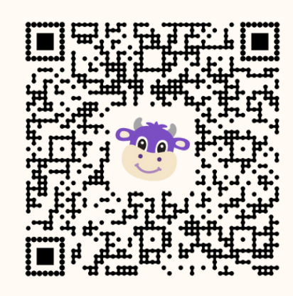
Find us on HappyCow