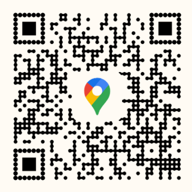
Leave us a review if you enjoyed!